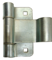
Option 3 part no. 1400C