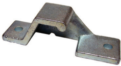
Options 1&2: Standard Base part no. 1500A - top part no. 1500A-M - top part no. 1500B - bottom part no. 1500B-M - bottom