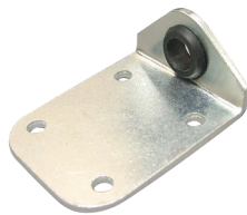
Dampening Rod Guide part no. 718 see page 228