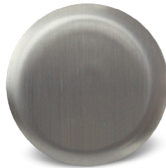
stainless steel, brushed