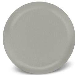
steel, gray painted