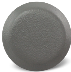
steel, ANSI 61 textured gray powder coat