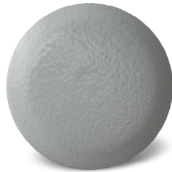
steel, RAL 7035 textured powder coat