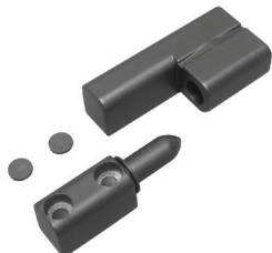
part number: ML08 right hand