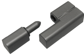
part number: ML05 left hand