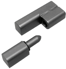
part number: ML06 right hand