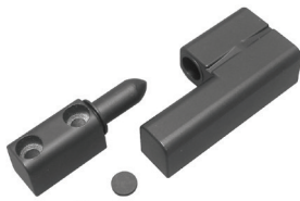
part number: ML07 left hand