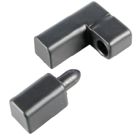
part number: ML46 right hand