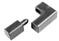
part number: ML45 left hand