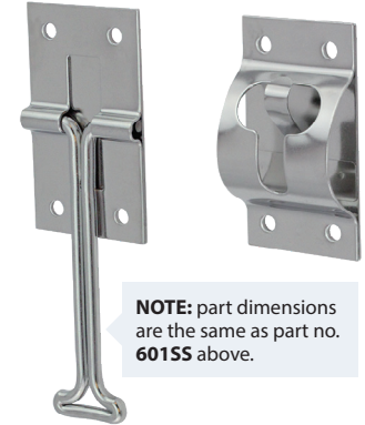
female dimensions are the same as male overall dimensions.